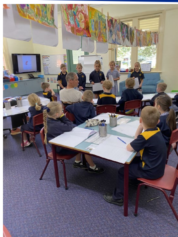
Sharing our letters with the Preps.